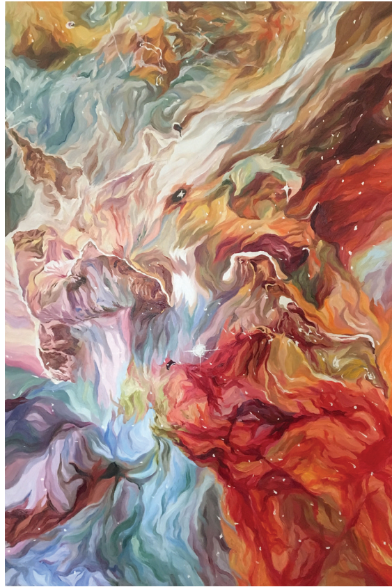
Medium: Oil on Canvas Dimensions: 65cm x 90cm