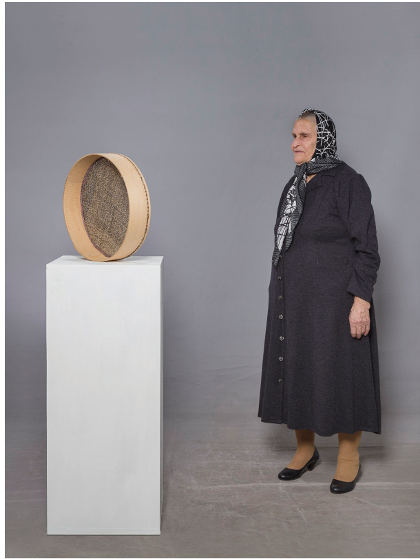
Medium: Photographic Print Dimensions: 50cm x 65cm