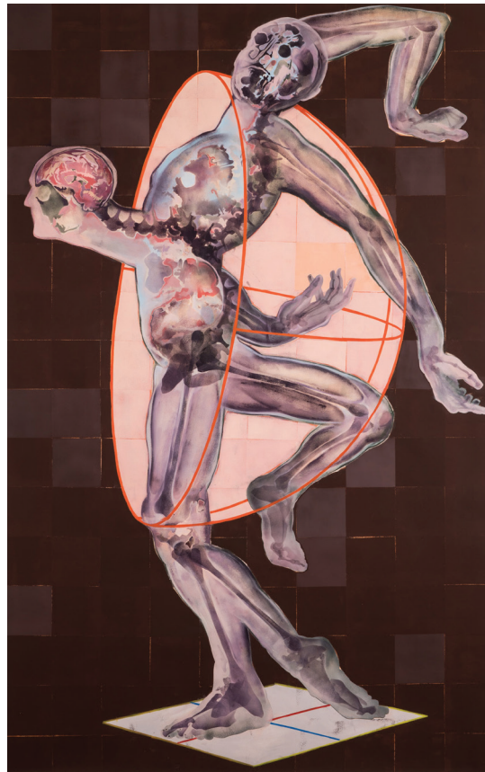
Medium: Acrylic and Linoprint paint on Arches Handcrafted Oil Paper Dimensions: 200cm x 130cm