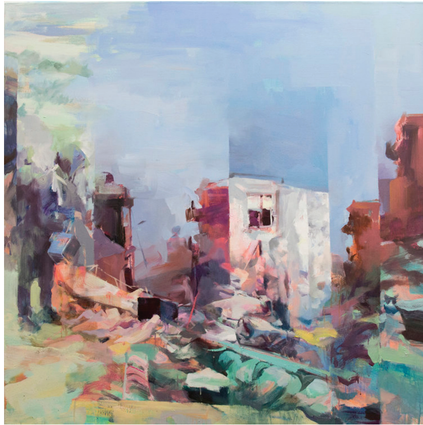
Medium: Oil and Acrylic on Canvas Dimensions: 120cm x 120cm