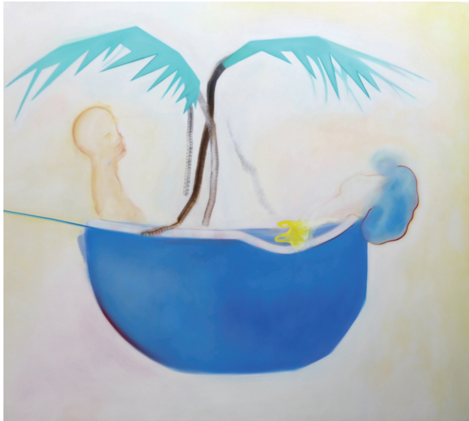
Medium: Oil on Canvas Dimensions: 190 x 170cm