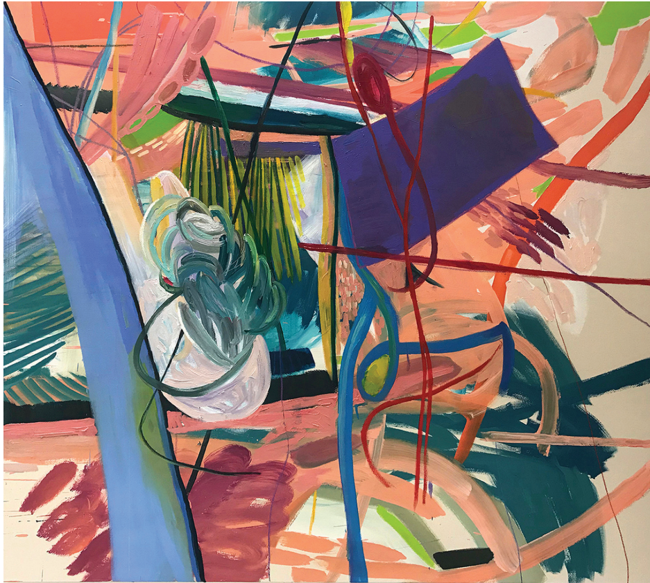
Medium: Acrylic, Marker, Oil pastel and Oil on Canvas Dimensions: 180cm x 200cm