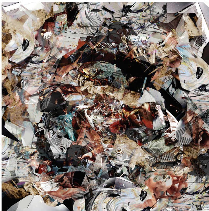
Medium: Inkjet Print on Paper Dimensions: 100cm x 100cm