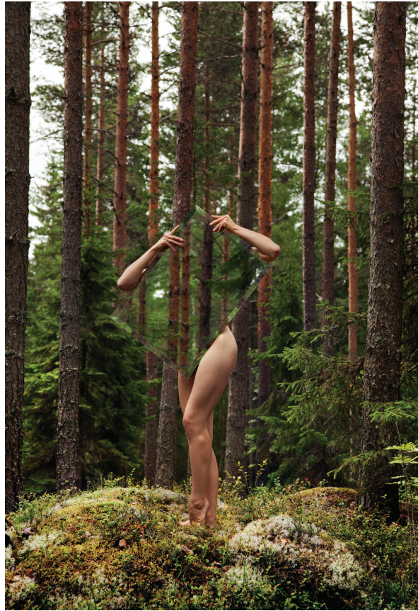
Medium: Inkjet print on Hahnemuhle paper Dimensions: 100cm x 70cm