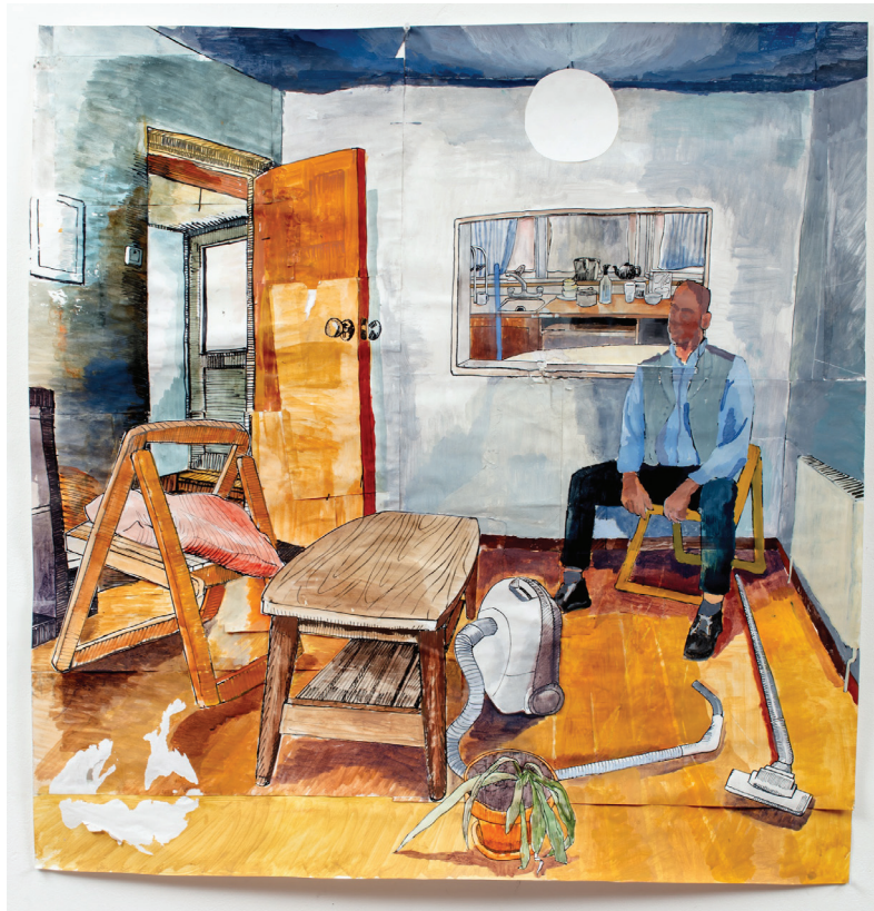
Medium: Gouache, Acrylic and Ink on Paper Dimensions: 115cm x 103cm