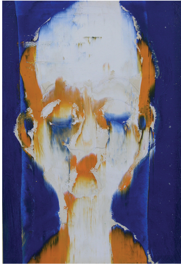
Medium: Oil on Paper Dimensions: 50cm x 40cm