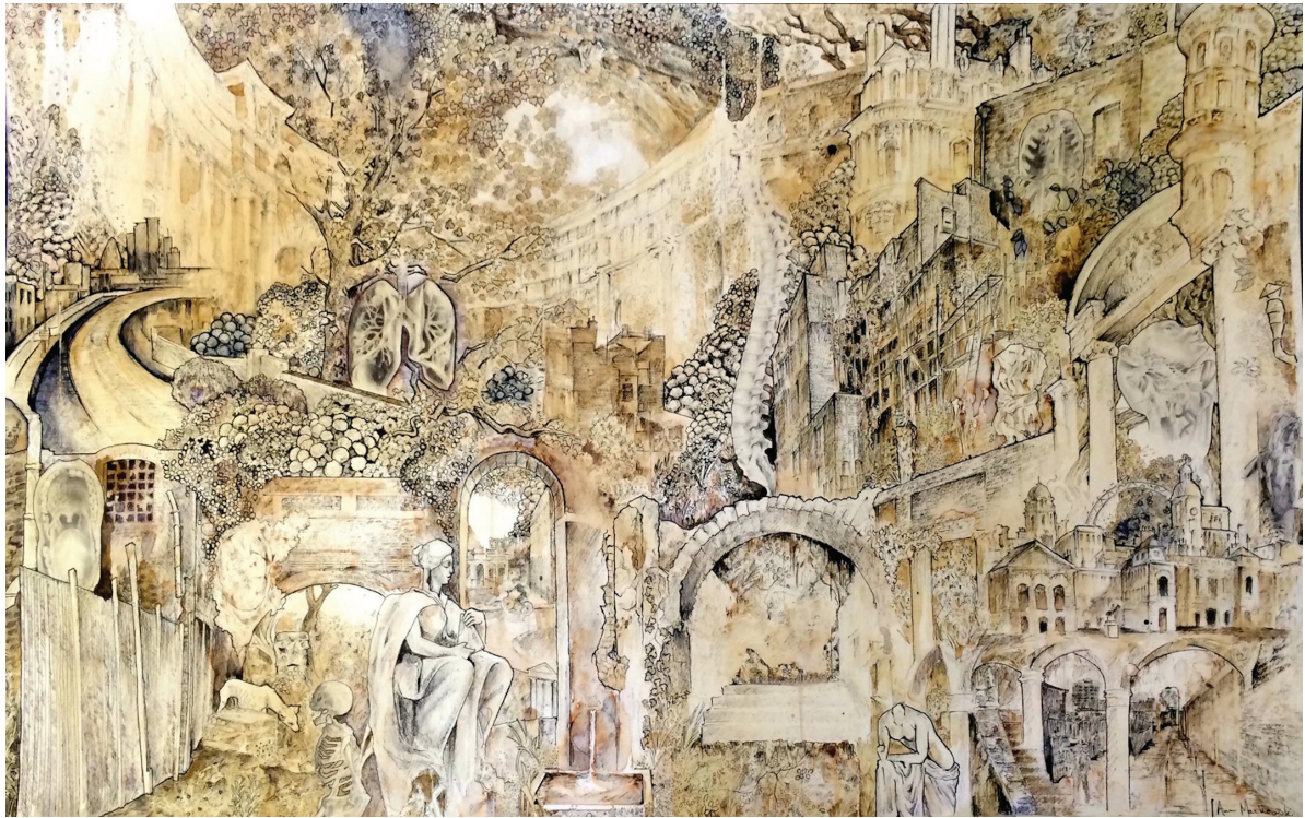
Medium: Organic Pigment on Paper Dimensions: 85cm x 125cm