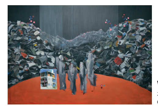
WAVE 220 x 150cm oil on canvas