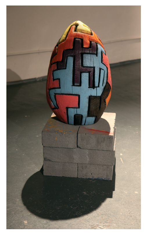
TOLIMA EGG charred oak and paint